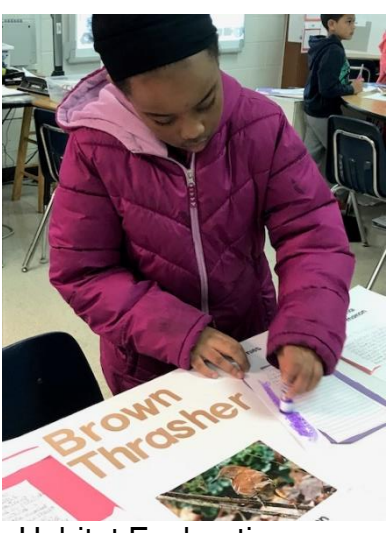
Habitat Exploration Bird and letter die cuts