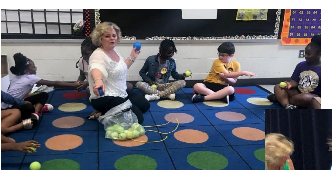
Flow of electrons / Electricity Kit