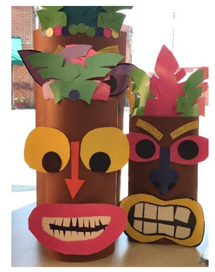
Students study Polynesian mythology and created tiki masks