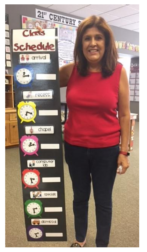
Class schedule: poster board, note cards, clock hands, and more are all available for your projects!