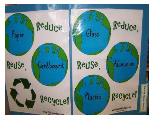
Check-out our file folders / task cards or specialize for student needs by creating your own